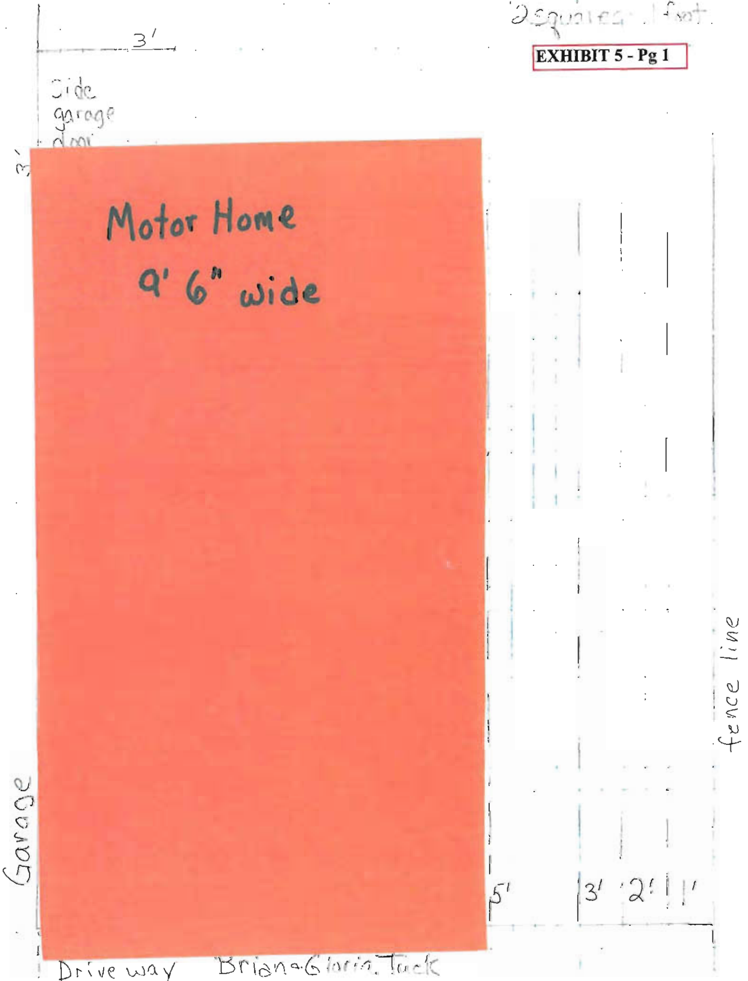
EXHIBIT 5 - Pg 1