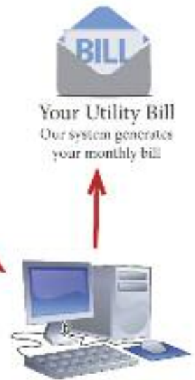
Billing System Meter data is collected

Your Utility Bill Our system generates your monthly bill