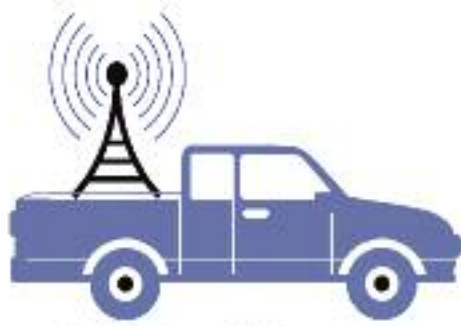
Mobile Data Collection