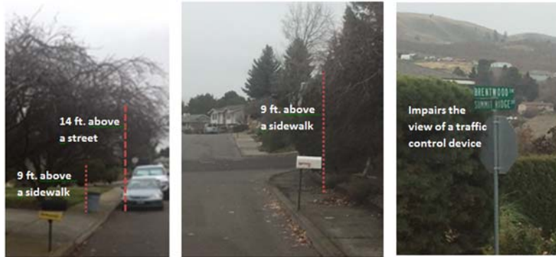
City of The Dalles Municipal Code 11.20.020 regulating street trees requires all trees growing near a sidewalk street or alley to be trimmed so that the limbs and branches are not less than nine feet above the sidewalk and 1) feet above the street. These trim requirements allow safe passage for pedestrians on sidewalks as well as garbage trucks and school buses traveling on streets and alleys.

For more information about trimming trees for traffic safety visit the City website thedalles.org/streets or contact the Public Works Department at (541) 296-5401.